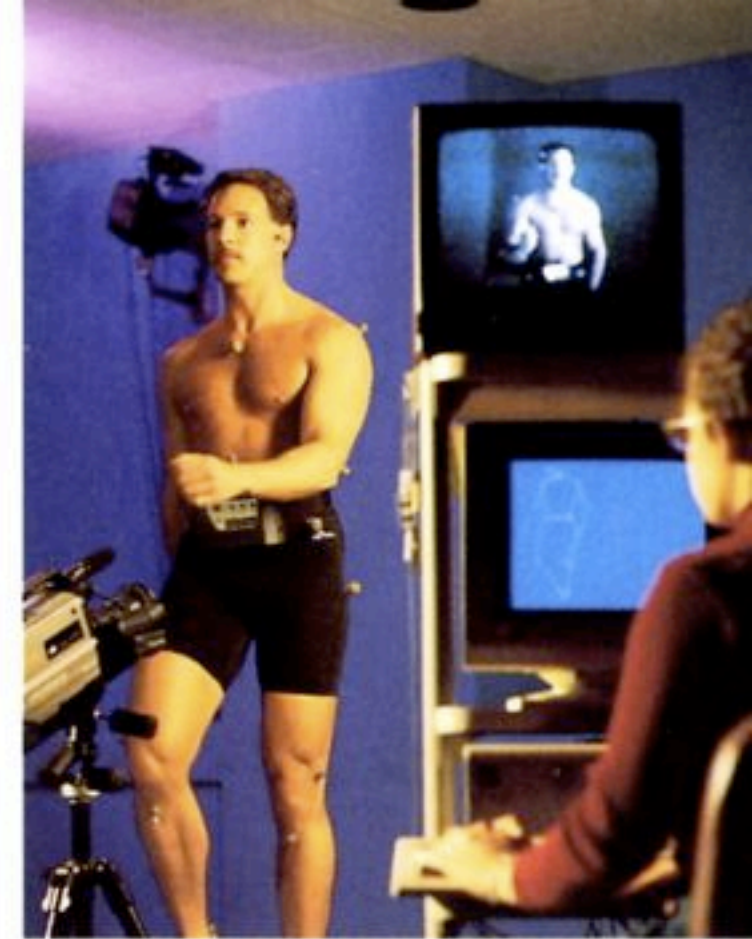
The College of Health Professions' Human Performance Laboratory is a state-of-the-science research facility dedicated to a better understanding of human movement.

Number of interdisciplinary core courses that CHP students take, in classes mixing students from all majors at the college, in order to gain competencies in healthcare dynamics, principles of science and research, healthcare informatics, and clinical care planning.